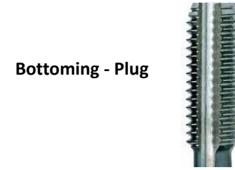
Bottoming - Plug